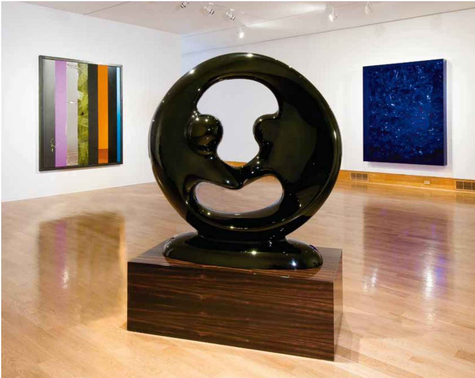
View of the exhibition "Anselm Reyle," 2011, showing (foreground) Harmony , 2007, bronze, chrome optics, plinth, Macassar wood veneer with piano lacquer.